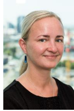
Operations & Purchasing Director