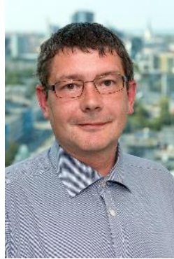
CEO & Biz Development Director