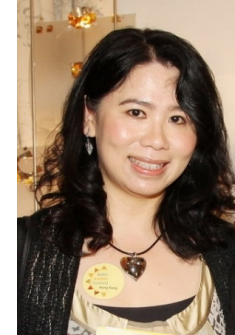
Hong Kong Director